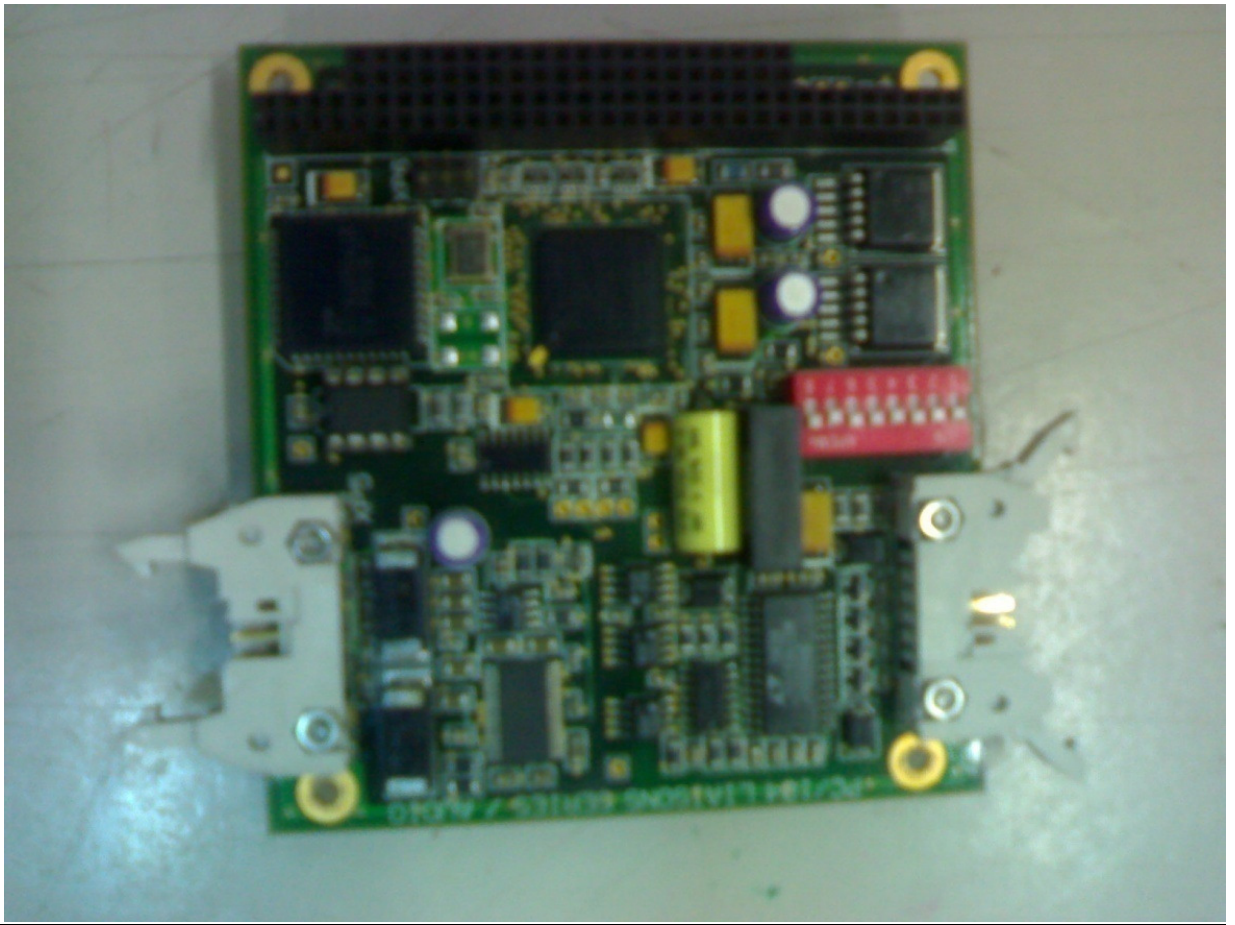
Bottom view image of Audio/Video Board