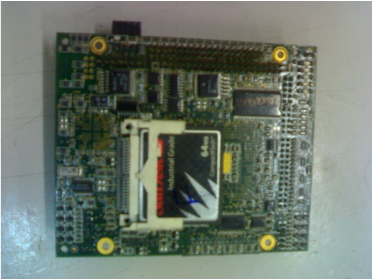
Top view of CPU Board