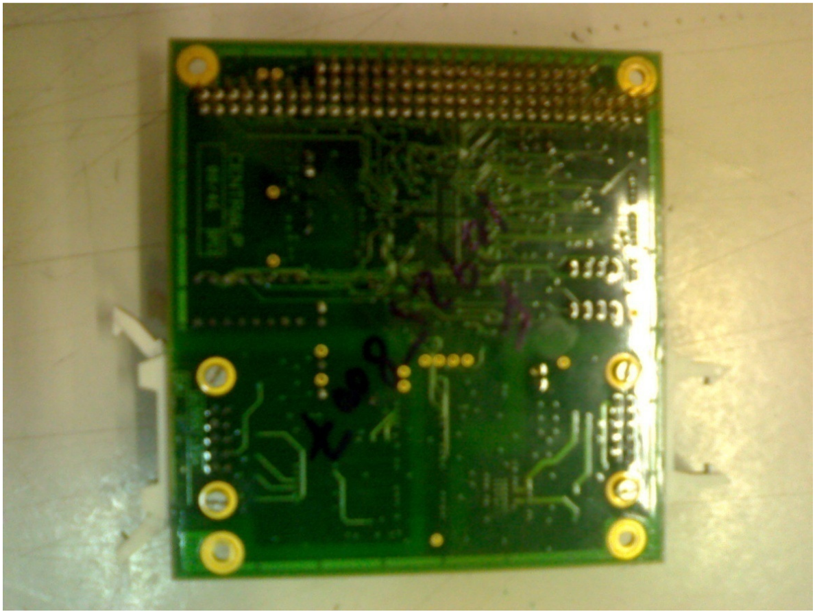
Top view image of Audio/Video board