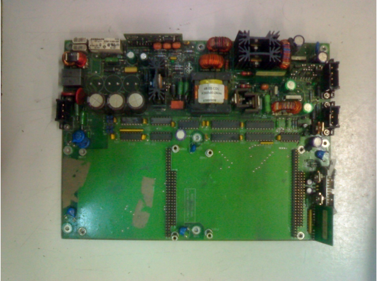
Top view image of Power supply board